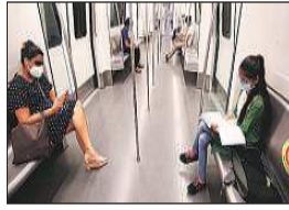
Most of the stations covered under the new initiative fall on the Yellow Line. Aravind

STARTING THURSDAY , Delhi Metro will use social media platforms to alert commuters of possible delays in advance if the waiting time for entering a station crosses 20 minutes. The Delhi Metro Rail Corporation said the purpose of the updates is to help commuters plan their journeys effectively. Long queues are being observed outside many stations at a limited number of entry gates are kept open to avoid overcrowding. "The official social media pages/handles of DMRC will post updates on the average waiting time at ten stations during peak hours in the morning (8.30 am to 10.30 am) and evening (5.30pm to 7.30 pm). This initiative is aimed at helping commuters plan their journey effectively so as to avoid long queues at entry/exit," DMRC said in a statement. The stations covered under this initiative are Chandni Chowk, Chawri Bazaar, Patel Chowk, Rajiv Chowk, Central Secretariat, Huda City Centre, Lal Quila, Barakhamba Road, JLN Stadium and Saket. Metro services in Delhi remained suspended between March 22 and September 6. Between September 7 and 12, services resumed in a graded manner. After a slow start, ridership has begun rising across lines. According to data shared by DMRC, the average daily line utilisation went up from 61.9,242 in September to 1,22,48,848 in October.